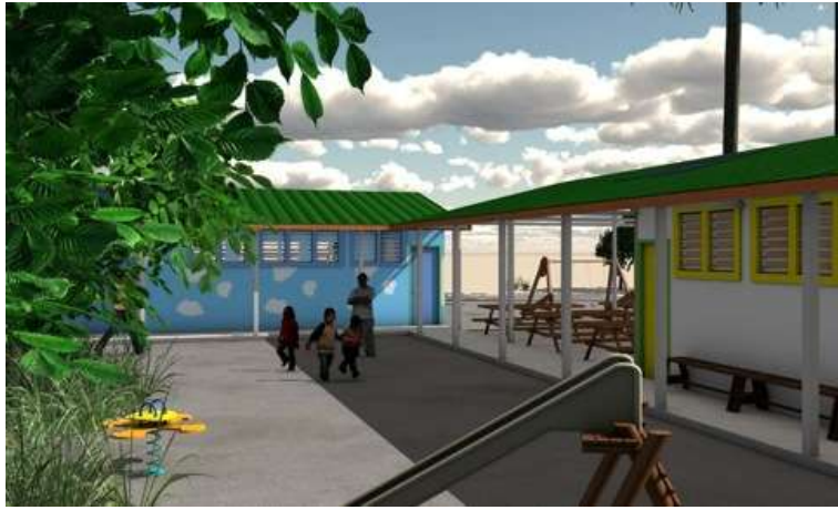
Projected image of what the Kindegarten at L'Ecole Nouvelle Zoranje will look like.

Your support has made it possible for us to Bridge the Gap much more quickly than anticipated. These generous gifts will soon be translated into a beacon of hope to the community of Port au Prince. We would like to invite you to spread the word about this project and future projects in Haiti. Simple choose to “like” HHF on Facebook and encourage your Facebook friends to do the same. Together, we can help to expand the HHF team as we share about the awareness of the ongoing needs.